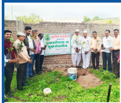
Tree Plantation Drive, Nashik

CYDA, in collaboration with other civic bodies, initiated tree plantation drives and social awareness campaigns to protect Mother Earth. World Nature Conservation Day celebrated on 28th July raises awareness about environmental threats. CYDA joined its mission to emphasize the importance of ensuring a sustainable ecosystem for future generations. Responsible and prompt action from everyone is vital.