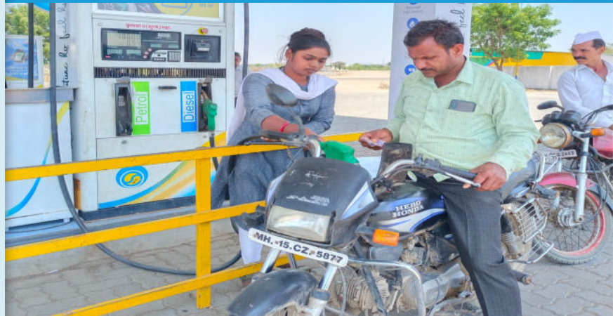
NTL beneficiary at Petrol Pump, Nashik

CYDA launched the "Non-traditional Livelihood" initiative with a vision to create a gender-neutral society. This initiative aims to ensure equal participation of women in male-dominated fields by equipping selected