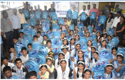
Students of Jijamata Prathamik and Madhyamik Vidyalaya, Bhosari receiving their school kits