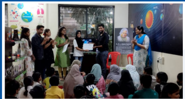
Moon Day celebration at STEM ILC, Yerawada