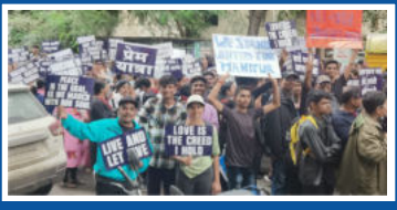
Youths during the Peace March for Manipur

The pain of Manipur extends beyond its boundaries and has captured the nation's attention. Many now stand in solidarity with Manipur. In Pune, CYDA, along with many like-minded organizations, came forward to express their solidarity and concern and called for prompt action. Around 21 youth from CYDA's Peace4Change wing actively participated in the Peace March, advocating for solutions through constitutional means. (Reported- Kaustubh Bhamare)