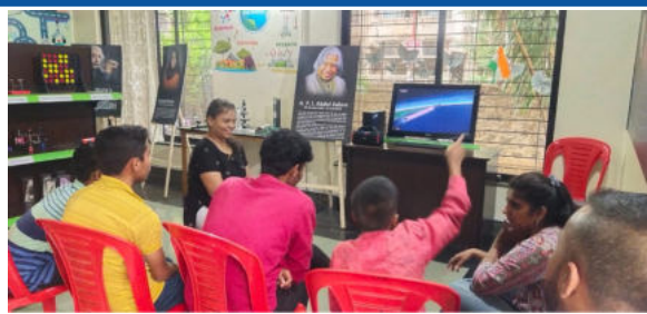
Live telecast of Chandrayaan 3 at STEM ILC, Yerawada

At the STEM Innovation Learning Centre, adolescents and youth have the opportunity to receive guidance and explore their potential, embarking on a journey filled with knowledge, experimentation, and fun. On 14 July, 2023, the successful launch of Chandrayaan 3 LVM took place. To enhance their curiosity and provide a better understanding of this mission, CYDA arranged a live telecast session at the STEM Innovation Learning Centre. Following the event, there was an engaging discussion on space and science, further fueling their interest.