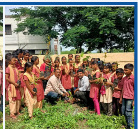
Tree Plantation Drive by students, Pharola