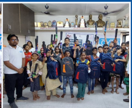
Migrant children receiving the education kits