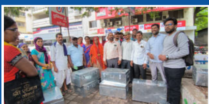
Migrants with the safety kits and BOCW cards

CYDA remains dedicated to integrating marginalized communities into the mainstream, offering unwavering support to migrant workers. Continuing its commitment, in July, CYDA extended assistance to 21 migrants, enabling them to avail benefits of the BOCW (Building and Other Construction Worker) card. CYDA also provided them with essential safety kits and facilitated access to Governmental Educational Schemes for the children of these migrant workers.